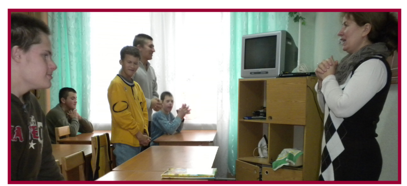
With deep gratitude for your partnership in this work, I pray God's blessings over your homes and families.